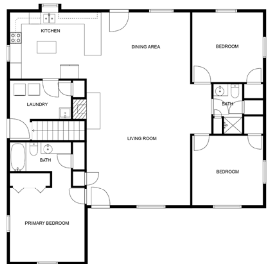
FLOOR PLAN CREATED BY CUBICASA APP; MEASUREMENTS DEEMED HIGHLY RELIABLE BUT NOT GUARANTEED.